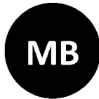
MB Matt black RAL 9005