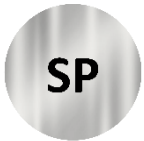
SP Polished Stainless Steel