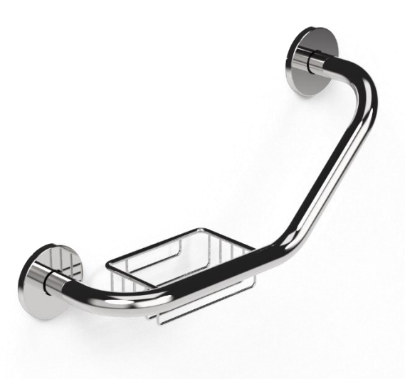
Right handed configuration shown