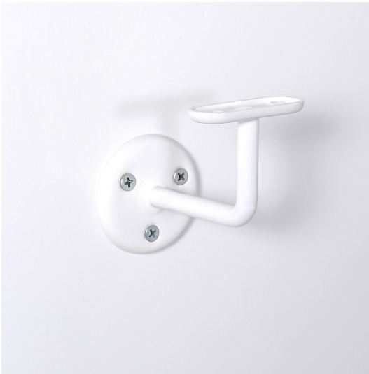
Hand rail bracket, 62mm